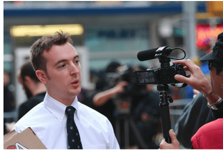
En: a cameraperson pointing a camera and mic at a speaker . GT: eine kamerakraft richtet eine kamera und ein mikrofon auf einen sprecher . Baseline: eine kameraperson zeigt auf eine kamera und mikrofon an einem redner . Q -WAAE: eine kameraperson richtet eine kamera und ein mikrofon an einem redner .

In figure 3, the baseline translates "pointing a camera" to "zeigt auf ein camera" which could translate to "to point at a camera". It is incorrect since the image displays the camera-man pointing a camera at the speaker. Also, the german verb "zeigen" also means to show, to demonstrate, which is not ideal in this example. Our model