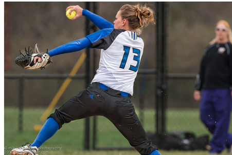
En: a woman winding up to pitch a softball . GT: eine frau bereitet sich darauf vor , einen softball zu werfen . Baseline: eine frau bereitet sich auf einen softballwurf vor . Q -WAAE: eine frau bereitet sich darauf vor , einen softball zu werfen .

translates "pointing" to "richtet" meaning "pointing" with the idea of aiming which is more suitable. Also Q -WAAE does not use wrong prepositions. The sentence of baseline scores a BLEU of 0 while the sentence score of our model is a BLEU of 44.83.