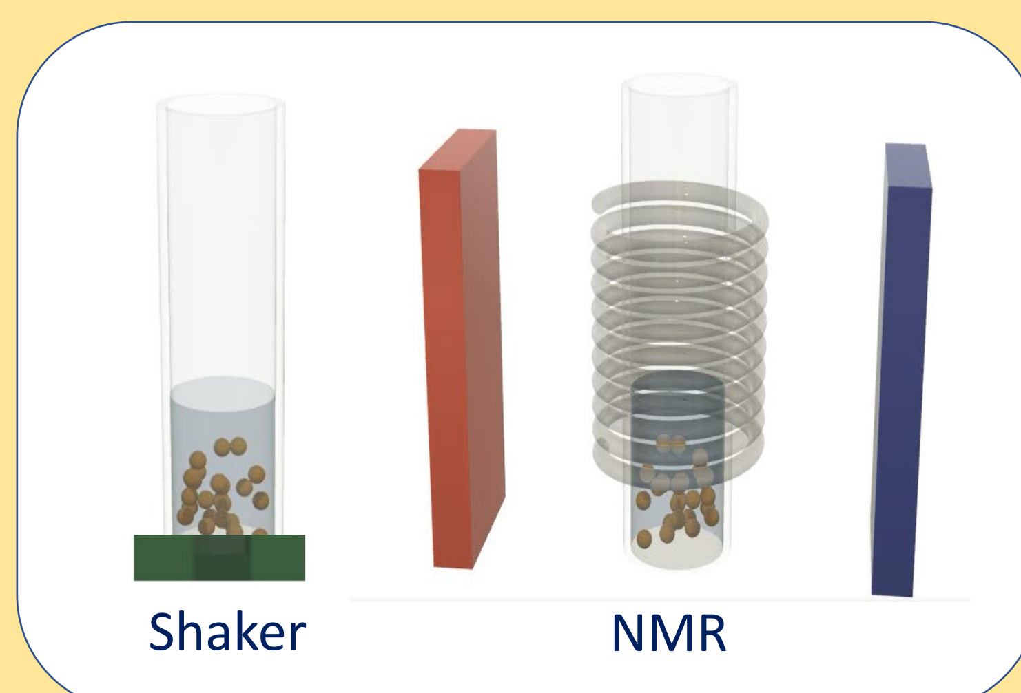
Figure 1. Experimental Set-up