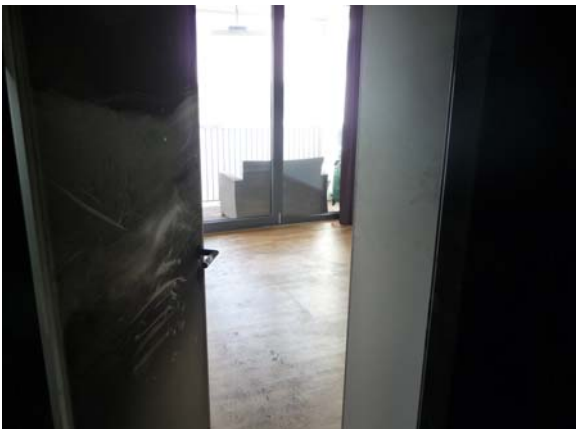
Figure 3: The bedroom with the balcony