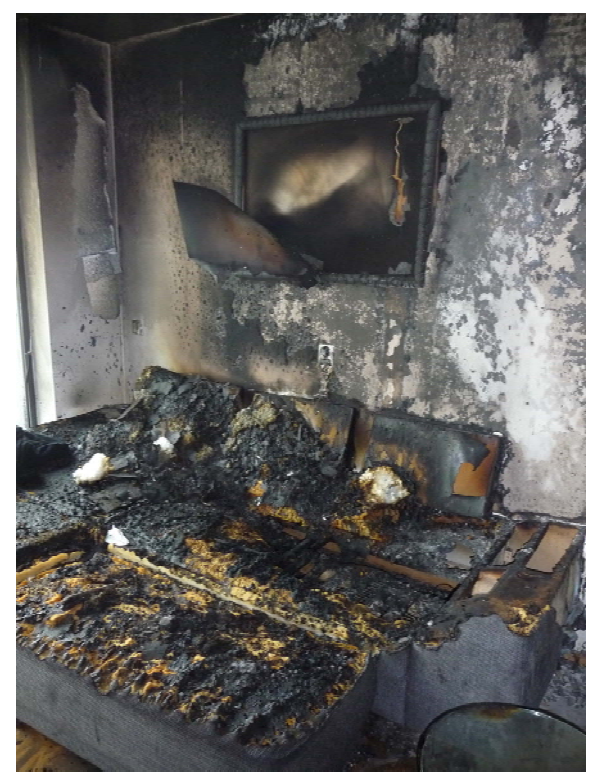
Figure 1: the sofa