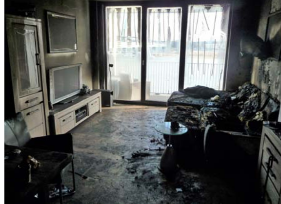
Figure 4: The living room